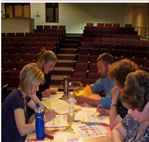
Thinking about Common Core Standards