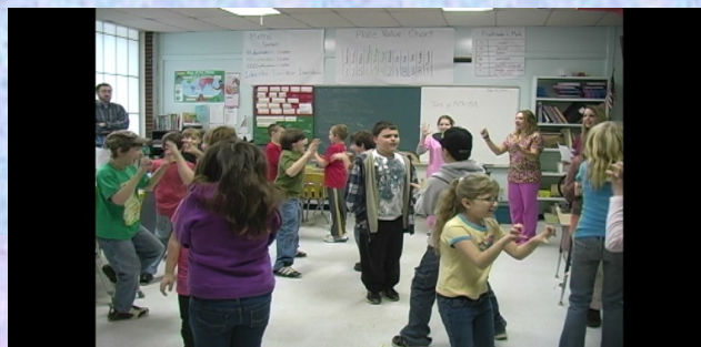
Webster Springs Elementary on 12/22/11

about the program, and will continue to implement the extra 15 minutes of physical activity into their classrooms daily. Plans are already made to train high school students at Greenbrier West and Greenbrier East High Schools on January 24 th who will then in turn train the Pre-K-8 teachers in their classrooms. Braxton County will receive training through their PE and Health teachers on February 20 th ; and Fayette, Pocahontas, and Nicholas Counties are also receiving the Let's Move Training.