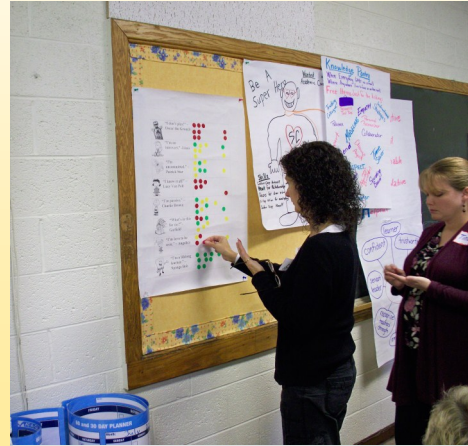
Instructional Coaches Collaborate